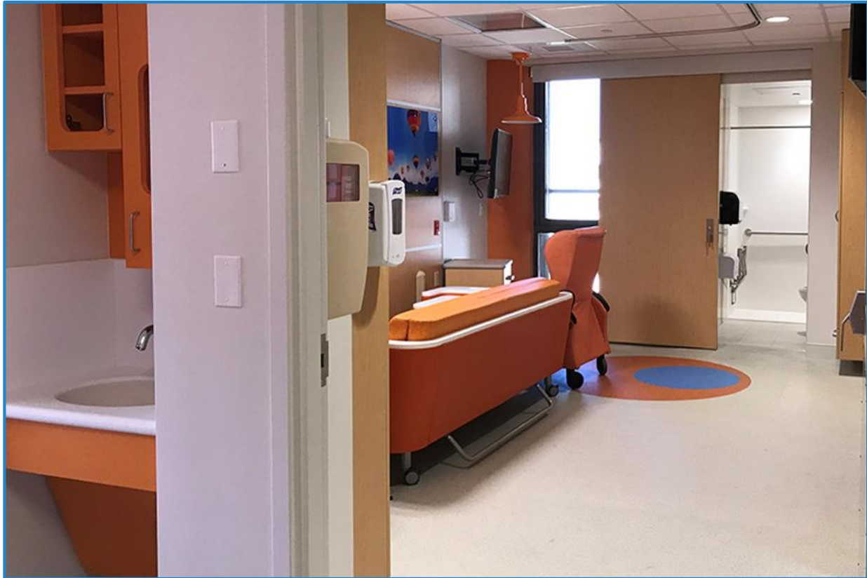
Jackson Holtz Children's Hospital – Miami, FL: This sheet-vinyl flooring installation involved the laying of circles within circles as colorful design accents.